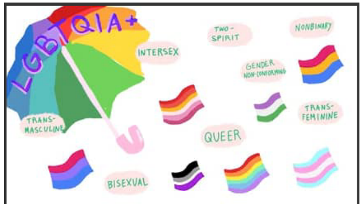
3 MINS: LGBTQIA+ UMBRELLA: DIFFERENCE BETWEEN GENDER, SEX, AND SEXUAL ORIENTATION BITLY.COM/LGBTQIAUMBRELLA